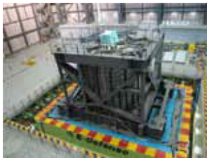
A pile and foundations fracture experiment using a big shaking table

Any structure that experiences a major earthquake may still, at a glance, appear to be solid and sound, but could actually have suffered severe damage in locations that cannot be visually confirmed. In particular, the cast-in-place reinforced concrete piles used in the construction of large buildings have suffered severe damage in many cases, including crushing of the underground concrete, but current technology does not provide a way to evaluate their damage without excavating the surrounding ground and performing a direct visual inspection. We therefore focused our attention on the changes in the vibration characteristics of a building that accompany damage to its piles, and aim to exploit this to develop safety evaluation techniques that do not require any soil-foundation excavation.