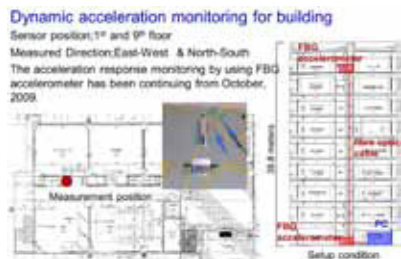
SHM system using FBG accelerometer in Toyohashi Tech.